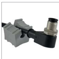
Slit KT grommets