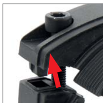
Injected elastomer gasket