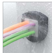
Certified protection class IP65/IP66/IP67/IP68